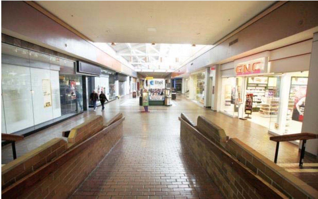
A few stores remain at Heritage Park Mall in Midwest City

MIDWEST CITY — Heritage Park Mall, once this city's shopping hub and now a nearly empty retail dinosaur, soon will close its doors.