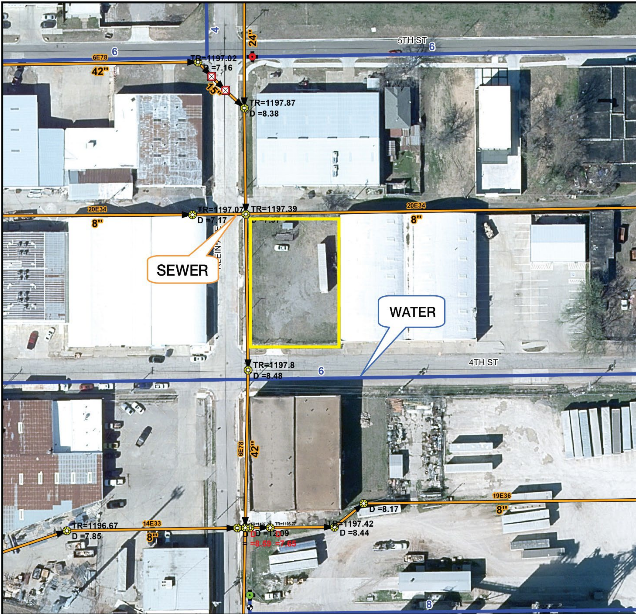
Aerial Photos from 2020